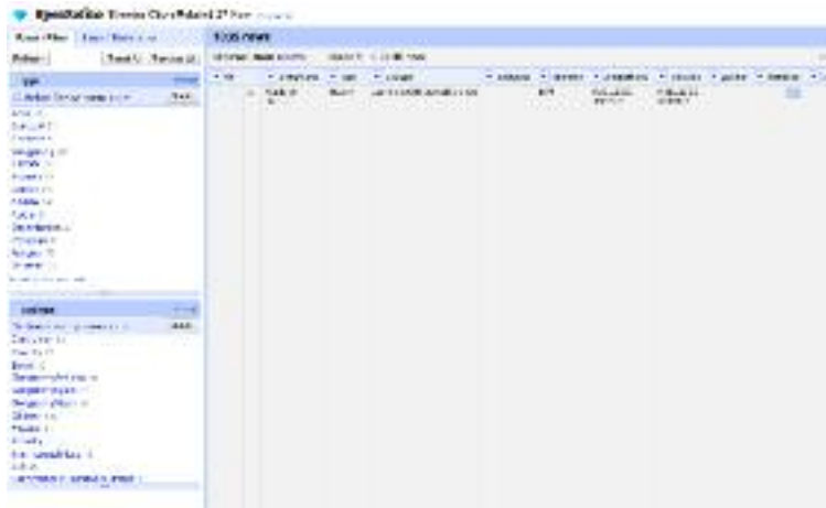
Figure 4. OpenRefine screenshot with the faceted browser menus.

Once all the tables were joined and nested —so, all listed, geo-positioned, with human descriptions, enriched by the Knowledge Graph, and automatic typed—, the classification of entities was completed using a semi-automatic homogenization of the themes using OpenRefine (detail in Figure 4), an open tool to manage and clean large datasets.