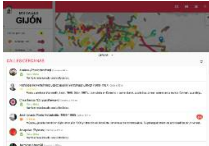
Figure 7. Nearby streets panel.

An interesting feature of this platform that contributes to its maintenance is the possibility of relying on the expert knowledge of citizens. Relatives and local culture enthusiasts may send comments to enhance descriptions, dates or even the pictures of the streets. A Web form, embedded in the details of streets, allows anyone to send their contributions. Up to date, the platform received more than a dozen of interesting corrections and adaptations, including original pictures.