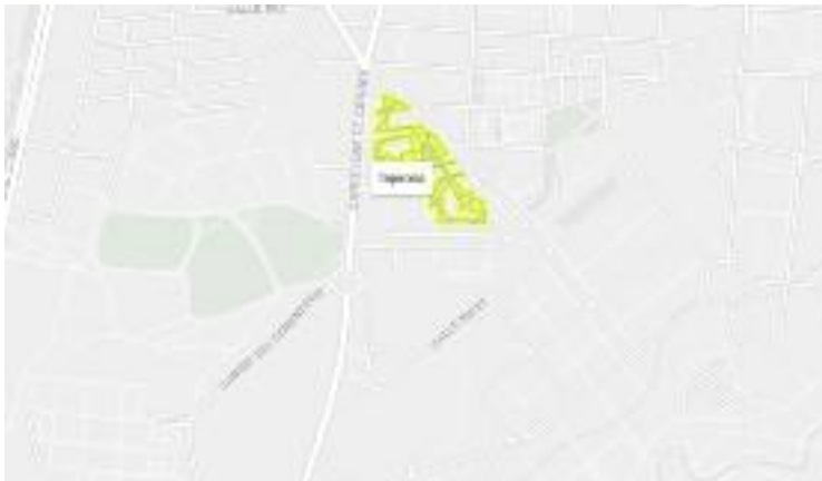
Figure 2. The geometry of a street in Mis Calles.

This technique arises successful results when the numbers of a street are distributed in an orthogonal geometry, but if the street has few registered portals, or the shape is complex it might generate polygons with weird forms, as can be seen in the example of the Tejerona Street in Figure 2.