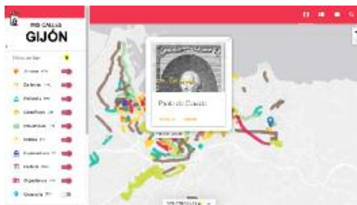
Figure 1. Map with street clusters and the detail of a street.

This application has been implemented in Gijón/Xixón (Spain) —a city in the north of Spain with more than 270,000 inhabitants (Instituto Nacional de Estadística, 2019)— collecting more than a hundred of street names, and organising them by theme as shown in the Figure 1. All the information is represented in an intuitive way, enabling visitors to explore the city on the move through their smartphones. The configuration of Mis Calles is automatic, but supervised by an expert, so it may be deployed all around the world with only minimal adjustments.