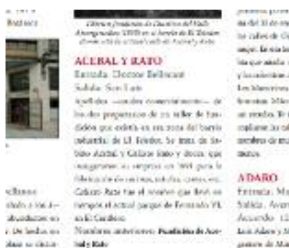
Figure 3. Detail of the publication in PDF.

figures, cites, etc.) resulted in a chaotic human-driven double check exercise.